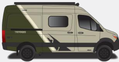
Optional Forest Glade Partial Paint (Sandstone Van Only)