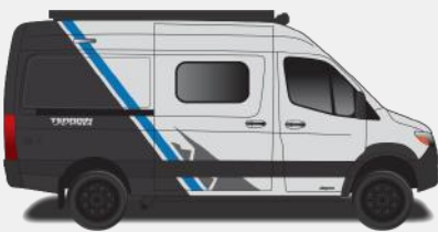
Optional Aztec Partial Paint (Silver Van Only)