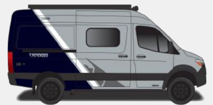
Optional Mystic Tide Partial Paint (Blue-Grey Van Only)